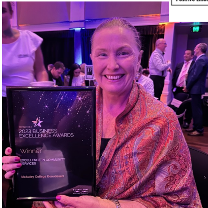
McAuley College wins Scenic Rim Excellence Award for Community Service 2023