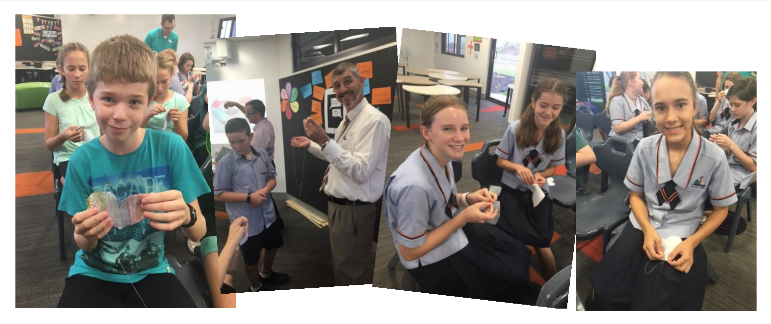
Finally, on Tuesday, we acknowledged Harmony Day with a prayer in Pastoral Care. The students also enjoyed some lunchtime activities that incorporated Indigenous games later in the week. Tuesday finished off with our inaugural Meet and Greet with our parents followed by an information evening.