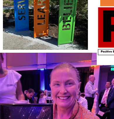
McAuley College wins Scenic Rim Excellence Award for Community Service 2023